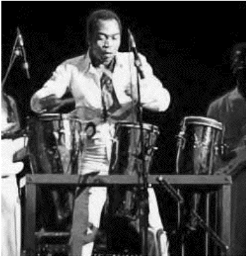
Fela, playing his own solo congas