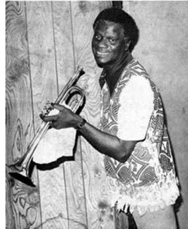
Victor Olaiya, the "Evil Genius" of HIGHLIFE