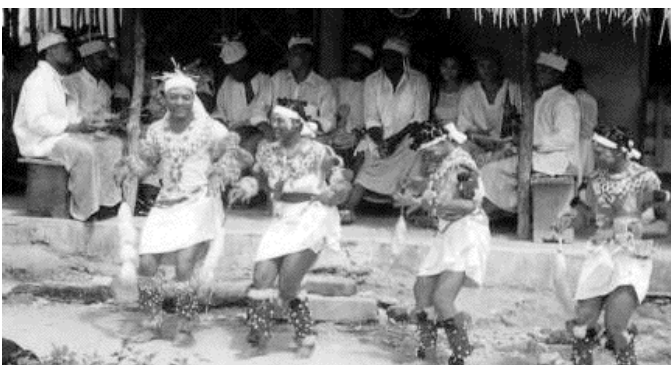
Traditional Efik Dance Group

His first experiences playing in public were with a traditional cultural group with women dancers, as a soloist on the “abodom”, the instrument that “speaks” and directs the dancers in their movements. His maternal aunt had to be persuaded to allow him to practice and perform with them because he was so young. These experiences were vital for him, and continued until the outbreak of the Nigeria/Biafra civil war in 1967.